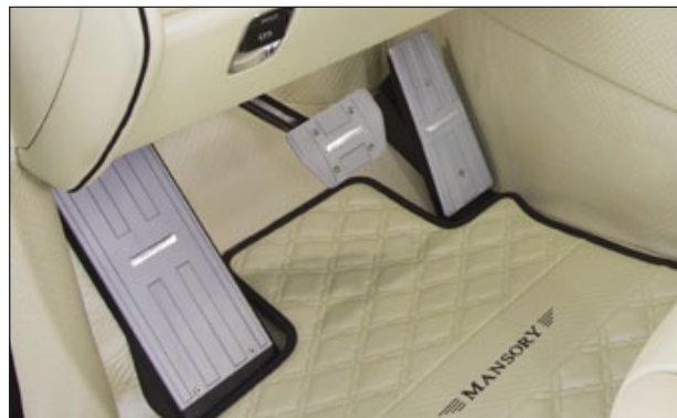
Sport pedals RRC 367 127