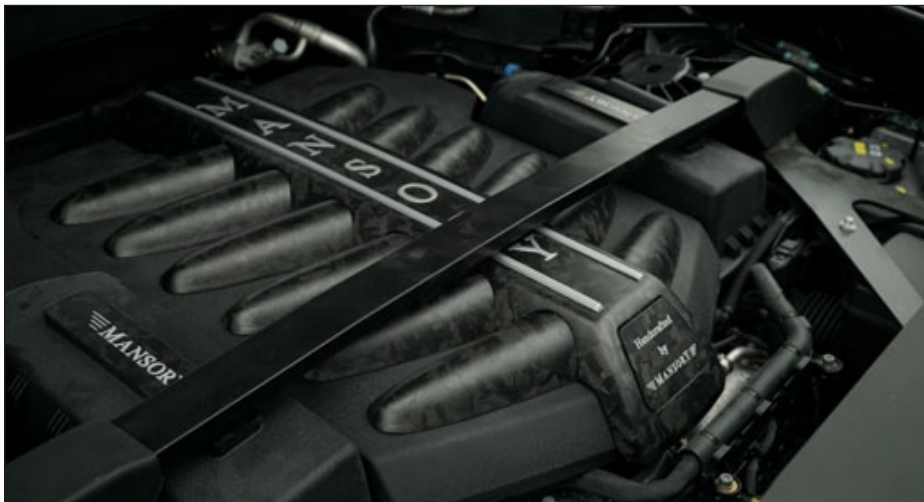
Engine cover with MANSORY logo