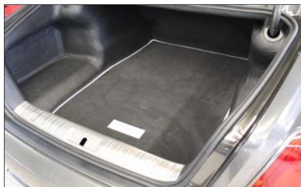
Trunk mat RRC 368 758

4 parts, front/ rear, left/ right with logo stitch