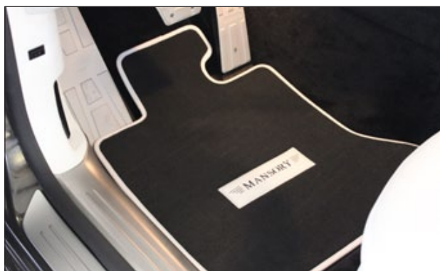
Floor mats RRC 367 758

4 parts, front/ rear, left/ right with logo stitch