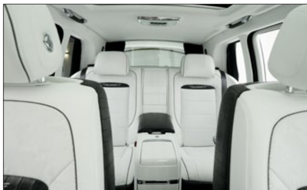
MANSORY Individualized Interior Kit ..... RRC 300 000

Complete refined interior, by exclusive leather sorts, combination on customers request.