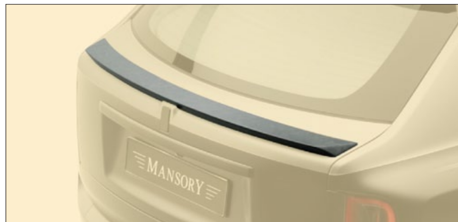
Rear decklid spoiler - exposed