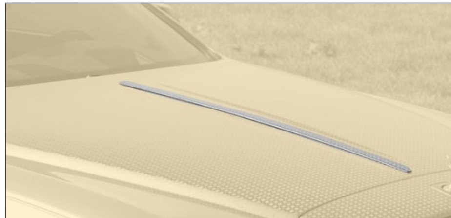
Bar for engine bonnet

2 parts set - left & right 2 parts set of emblem with MANSORY logo