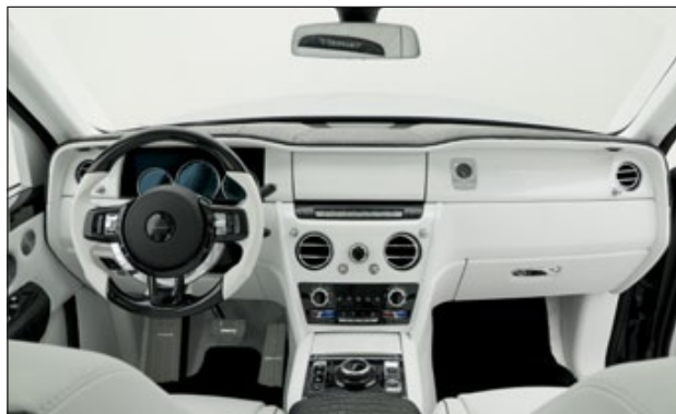
Interior trims RRC 300 001

set instrument panels, cockpit & front middle console tunnel covers. available with carbon and wood