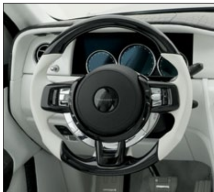
Sport steering wheel with MANSORY logo