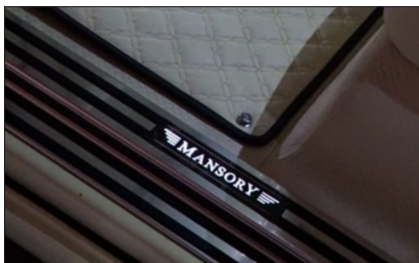
Entrance panels with illuminated ..... RRC 395 351

Complete refined interior, by exclusive leather sorts, combination on customers request.