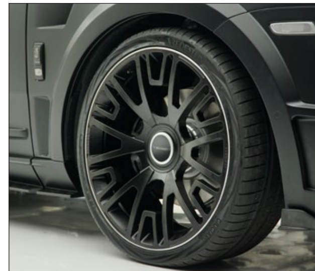
V.6 wheel 24" fully forged V6 24 10 25 112 B Diamond black