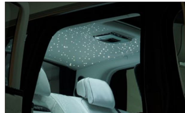
Headliner RRC 390 000