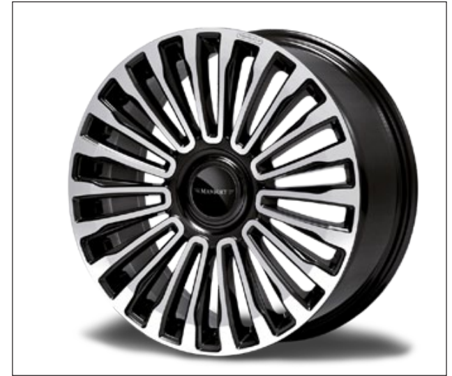
CS.11 22 inch (Diamond silver) CS11 22 9 30 1230 S CS.11 22 inch (Diamond anthracite) CS11 22 9 30 1230 A CS.11 22 inch (Diamond black) CS11 22 9 30 1230 B