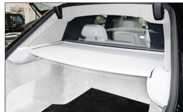
Trunk house decor RRC 368 500

Complete refined trunk compartment, by exclusive leather sorts, combination on customers request.