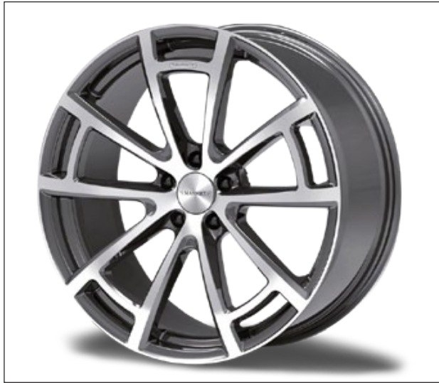
CS.5 22 inch (Diamond silver) CS5 22 95 35 112 S CS.5 22 inch (Diamond anthracite) CS5 22 95 35 112 A CS.5 22 inch (Diamond black) CS5 22 95 35 112 B