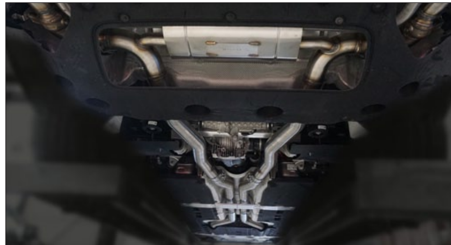
Sport Exhaust System Connection Pipes & Muffler