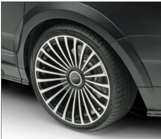
FS.23 wheel 24" fully forged wheel FS.23 24 20 112 130D Diamond black