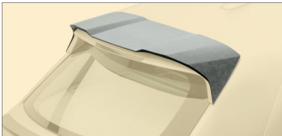
Roof spoiler - exposed