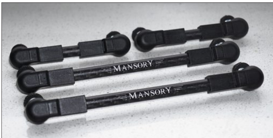
MANSORY Lowering Suspension for Rolls Royce Cullinan

2 level adjusting rods front axle, 2 level adjusting rods rear axle Lowering of approx 20-30 mm