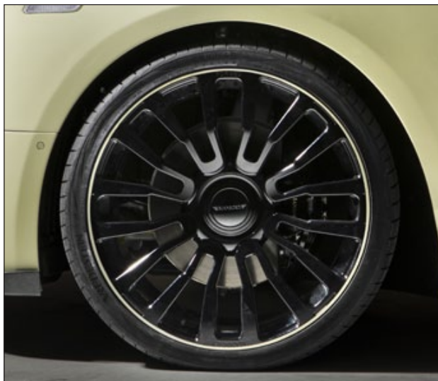
Y.8 wheel 24" fully forged wheel Y8 24 10 25 112 B Diamond black