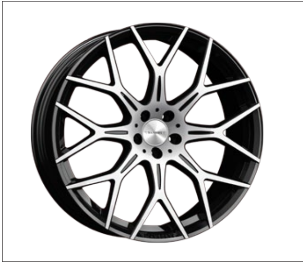
N.80 23 inch (Diamond black) N80 23 105 45 112 B N.80 23 inch (Diamond anthracite) N80 23 105 45 112 A FA: 10.5x23 ET 45 + 25mm spacer