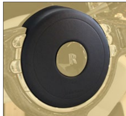
Airbag cover ..... RRC 351 500

available with leather, alcantara, carbon, wood