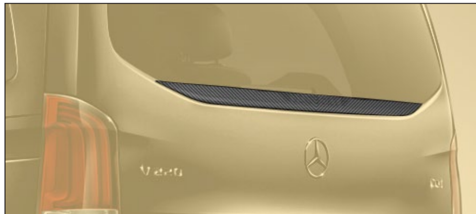
Rear deck lid spoiler carbon ..... 447 830 841

visible carbon fibre primed without clear coat