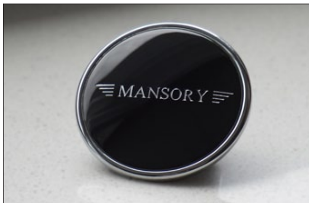
Logo emblem badge for Mercedes bonnet MMB 102 665 Replaces MB star for original engine bonnet