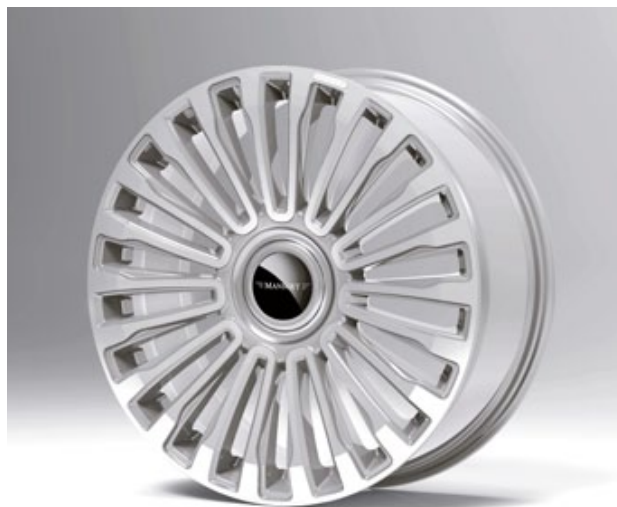
Multispoke 19 inch Diamond silver