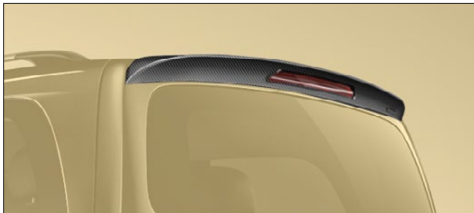
Roof spoiler visible carbon ..... 447 630 751

visible carbon fibre primed without clear coat