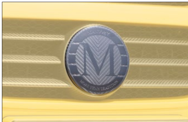
Middle cover for grill mask 447 102 355 visible carbon fibre glossy*