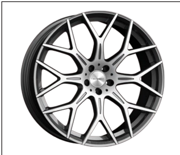
M80 Wheels 19 inch - ANTHRACITE DIAMOND