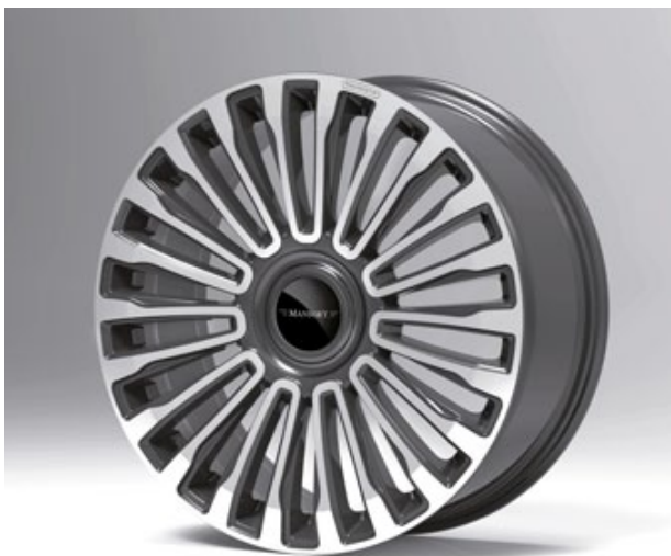
Multispoke 19 inch Diamond anthracite