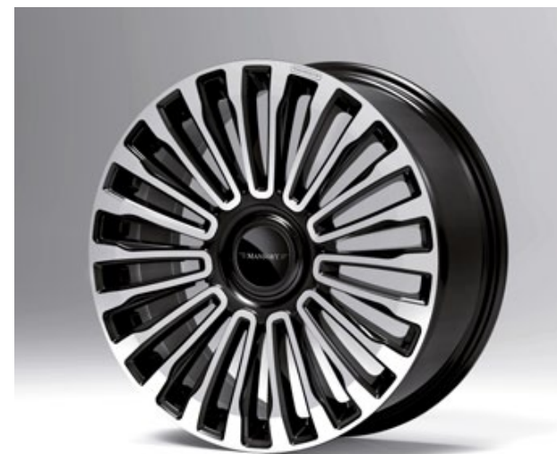
Multispoke 19 inch Diamond black