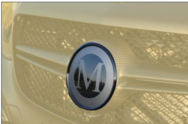
Front grill mask emblem with M MMB 102 351