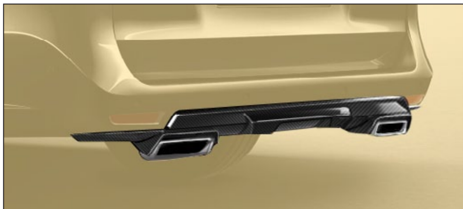
Rear diffuser visible carbon - with exhaust blinds ..... 447 802 021

visible carbon fibre primed without clear coat