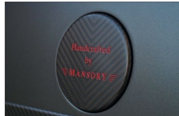
Rear hatch emblem 447 802 761 visible carbon fibre glossy*