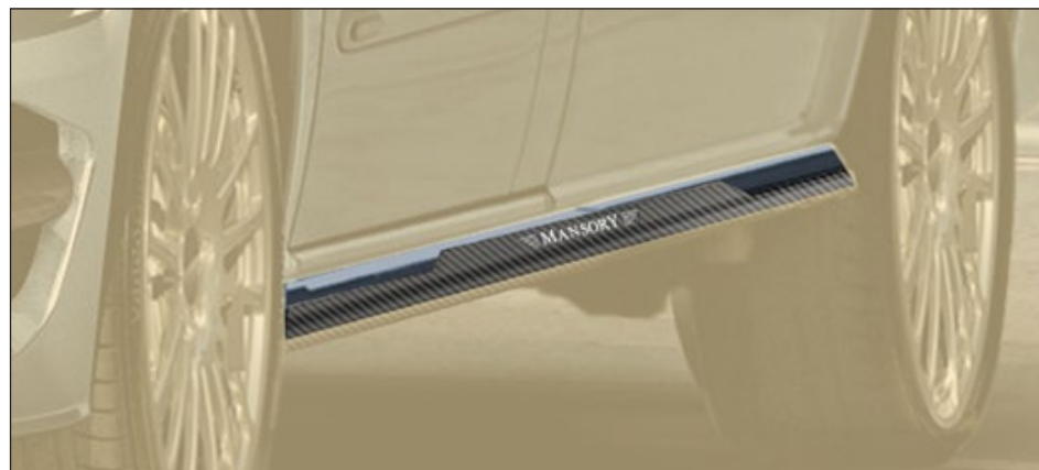
Side skirts ..... 447 595 021

visible carbon fibre area under MANSORY logo