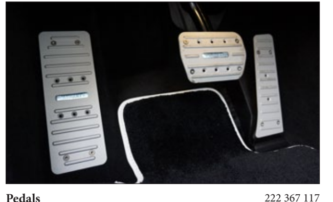
Pedals foot rest, brake and acc. pedal

Entrance panels222 395 331innerSet 4 pcs - front / rear, left / rightEntrance panels - Long version222 395 341innerSet 4 pcs - front / rear, left / rightvisible carbon fibre primed without clear coat