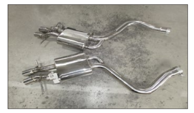
Mufflers set - left & right with throttle control