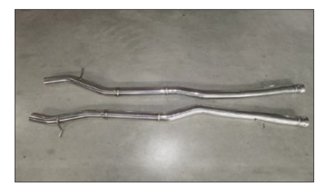
Exhaust middle pipes