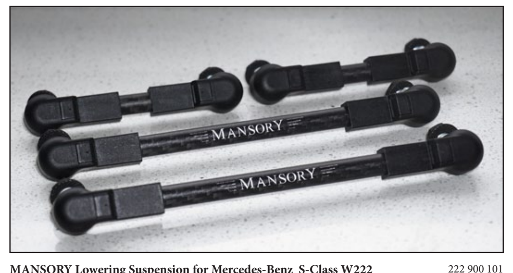
MANSORY Lowering Suspension for Mercedes-Benz S-Class W222 2 level adjusting rods front axle, 2 level adjusting rods rear axle Lowering of approx 20-30 mm