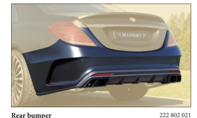
Rear bumper with diffuser visible carbon fibre without clear coat air intakes, reflectors, OEM light, exhaust blinds