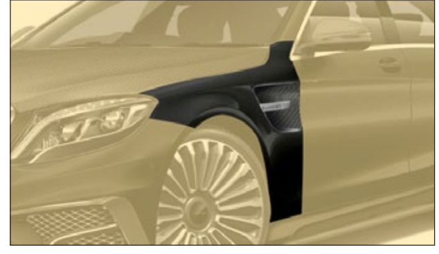
Front fender 2 parts set - left & right, with MANSORY logo with design elements visible carbon fibre with clear coat