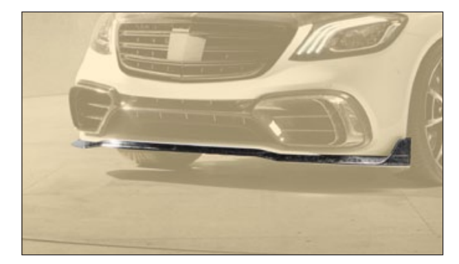
Front lip S63/65 AMG visible carbon fibre glossy*