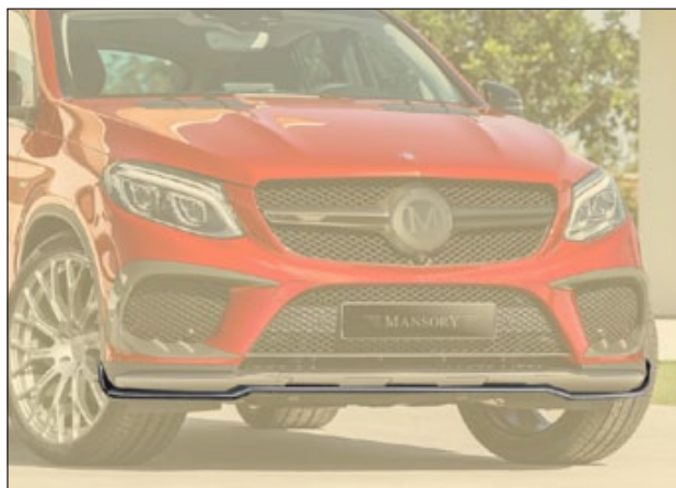
Front lip cover - AMG Styling C292 182 841

❶ assumption of reflectors from original rear bumper