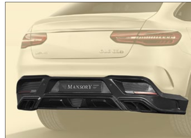
Diffuser C292 802 891

visible carbon fibre primed without clear coat with new designed double exhaust blinds