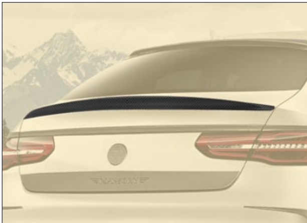
Rear trunk spoiler C292 830 841