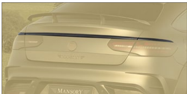
Rear panel C292 802 751

visible carbon fibre glossy*, with MANSORY logo