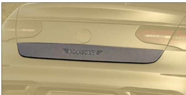
Rear hatch panel C292 802 741

visible carbon fibre glossy*, with MANSORY logo