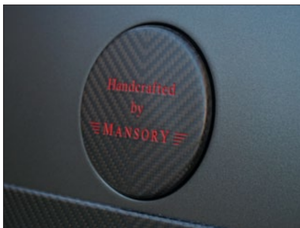
Rear hatch emblem C292 802 761