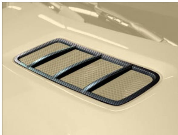
Air outtake splitter for OEM bonnet C292 210 751