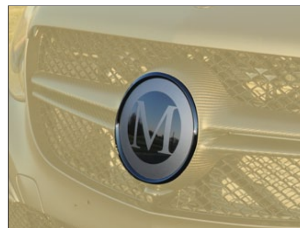
Front grill mask emblem with M MMB 102 351