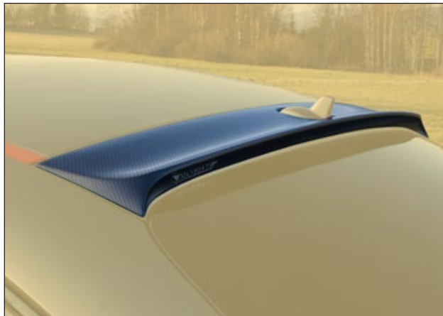
Roof spoiler cover C292 630 751