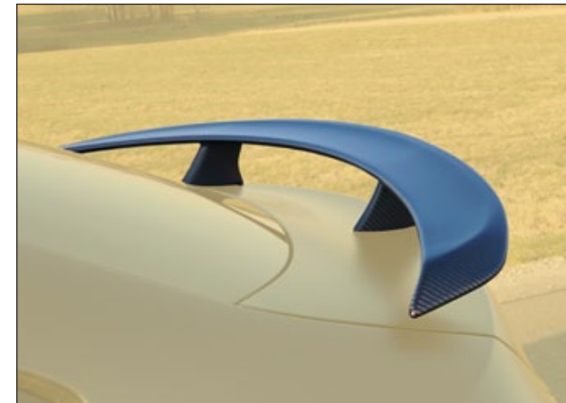
MANSORY rear wing - exposed C292 830 301

visible carbon fibre primed without clear coat