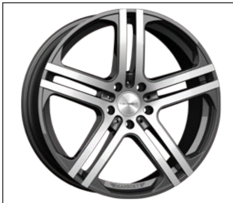
M50 Wheels - ANTHRACITE DIAMOND