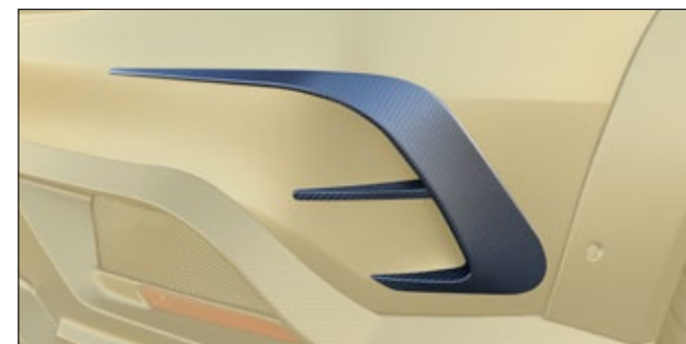
Air outtake splitter C292 802 251

visible carbon fibre glossy*, with MANSORY logo