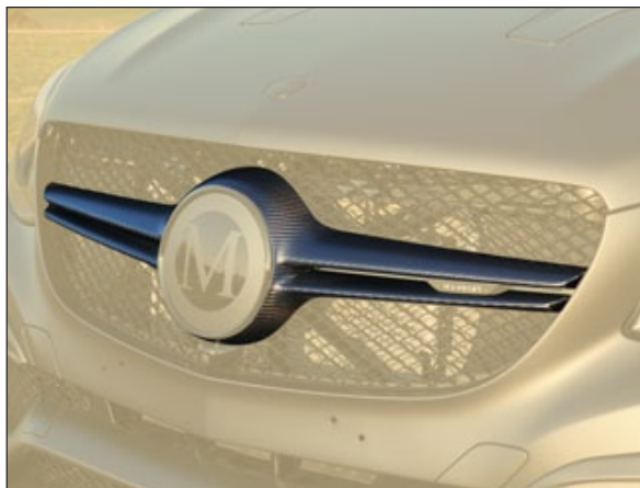
Front grill mask C292 102 331

① compatible only original engine bonnet