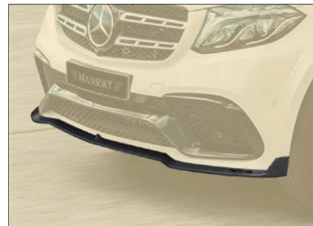
Front lip cover for AMG 63 OEM C292 182 851

visible carbon fibre primed without clear coat