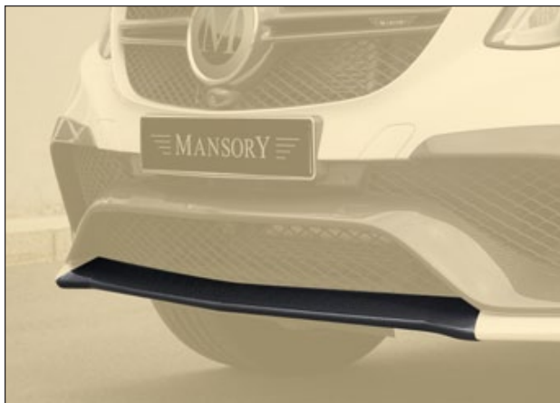
Front lip cover C292 102 841

visible carbon fibre primed without clear coat