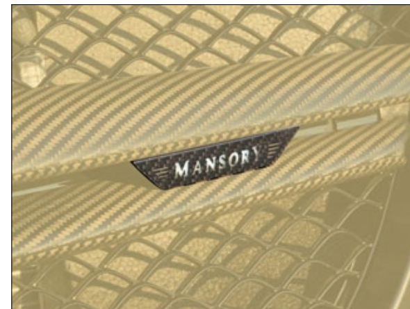
Logo for front grill mask C190 102 431