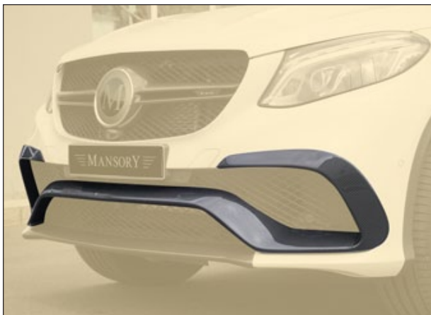
Front splitter C292 102 891

visible carbon fibre primed without clear coat