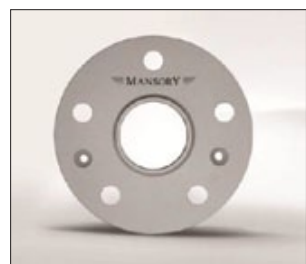
Kit of spacer for Wide body