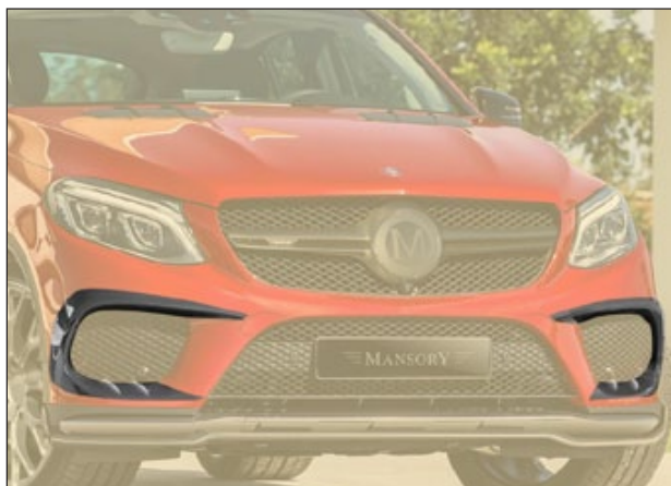
Front splitter - AMG Styling C292 182 891

visible carbon fibre primed without clear coat